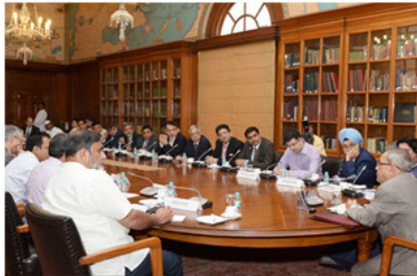
Our CEO with President of India & Other INDIAN Delegates (Norway & Finland) - 2014