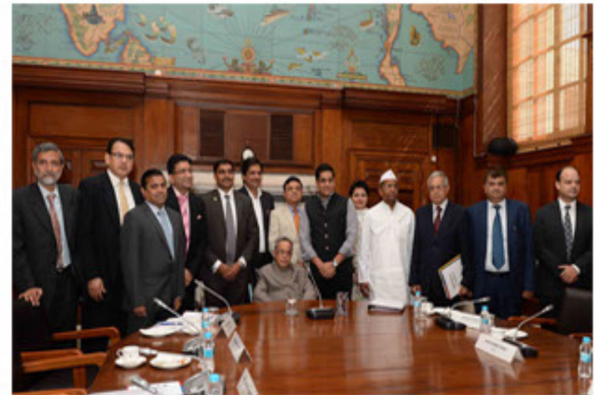
Our CEO With Prime Minister Modi and INDIAN Delegates in Colombo (Sri Lanka) - 2015