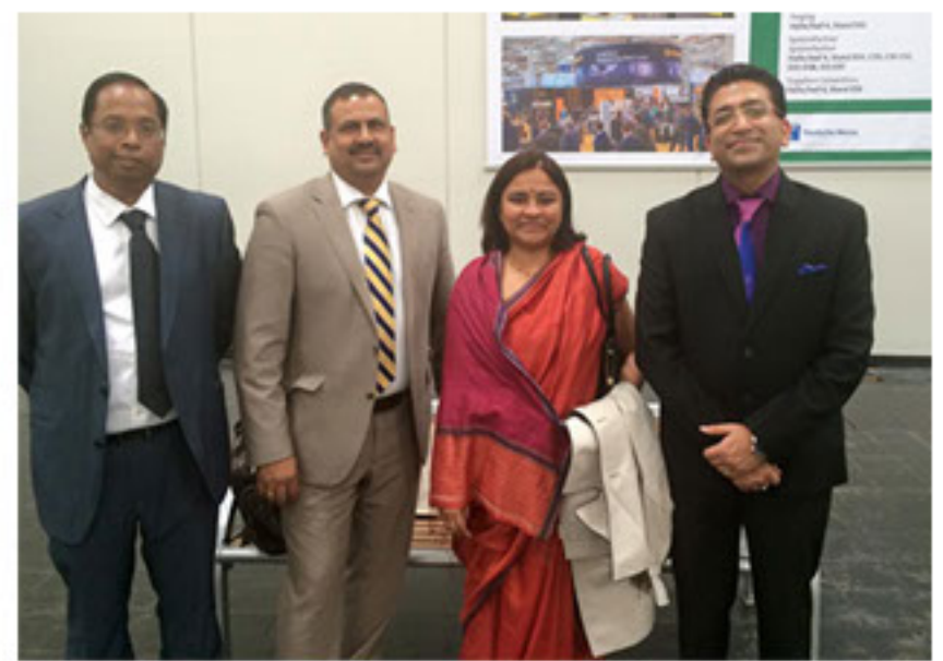
Our CEO with H.E the President of India - at Grand Hotel Stockholm(Sweden) - 2015