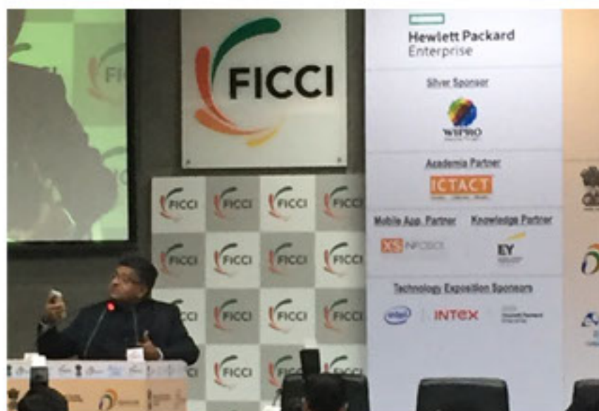
Our company partnered i Bharat (FICCI Event)